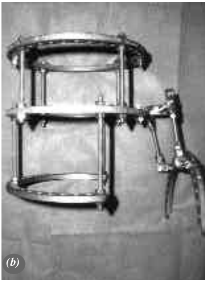
Figure 1: (a) front and (b) side appearance of the device used for mid foot breaks